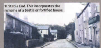
9. Stable End. This incorporates the remains of a bastle or fortified house.