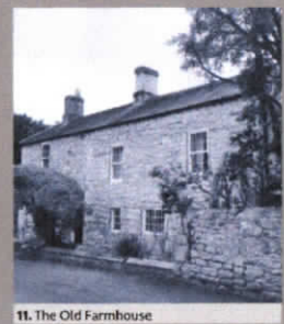
11. The Old Farmhouse