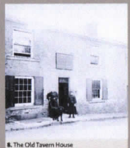
8. The Old Tavern House