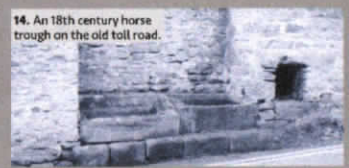
14. An 18th century horse trough on the old toll road.