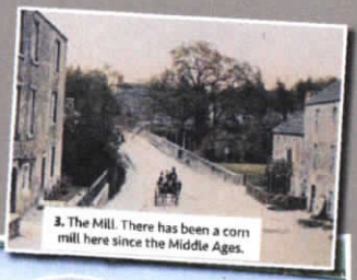
3. The Mill. There has been a corn mill here since the Middle Ages.

past. It explores the old mill which names our village, includes churches past and present and an ancient packhorse bridge. The trail also explains the importance of the River Tyne and the railway in creating and shaping the place we enjoy today.