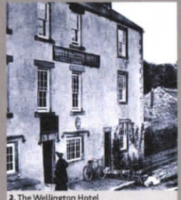
2. The Wellington Hotel