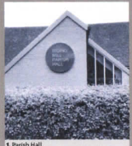
1. Parish Hall