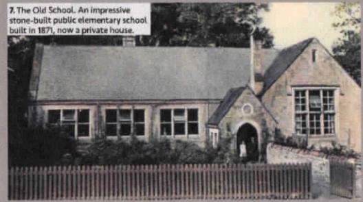
7. The Old School. An impressive stone-built public elementary school built in 1871, now a private house.