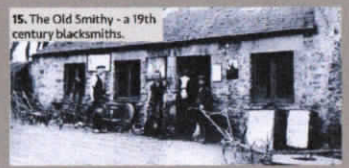
15. The Old Smithy - a 19th century blacksmiths.