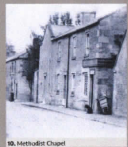
10. Methodist Chapel