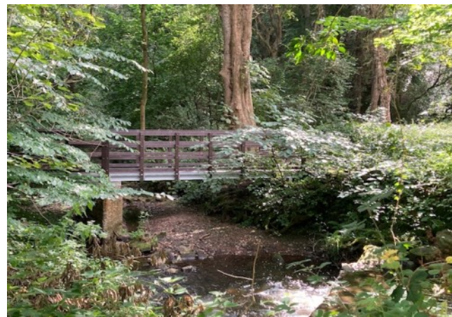
New weir footbridge—it's wider, allowing better access for everyone.

As part of our climate change actions, we are actively pursuing the possible installation of EV charging points with the County Council.